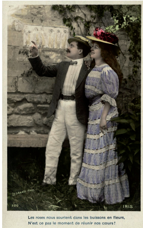
Les roses nous sourient dans les buissons en fleurs, N'est ce pas le moment de réunir nos cœurs?

2 / Manon Weiser Tinder Man, the greatest hero of them all 2014 © Manon Weiser