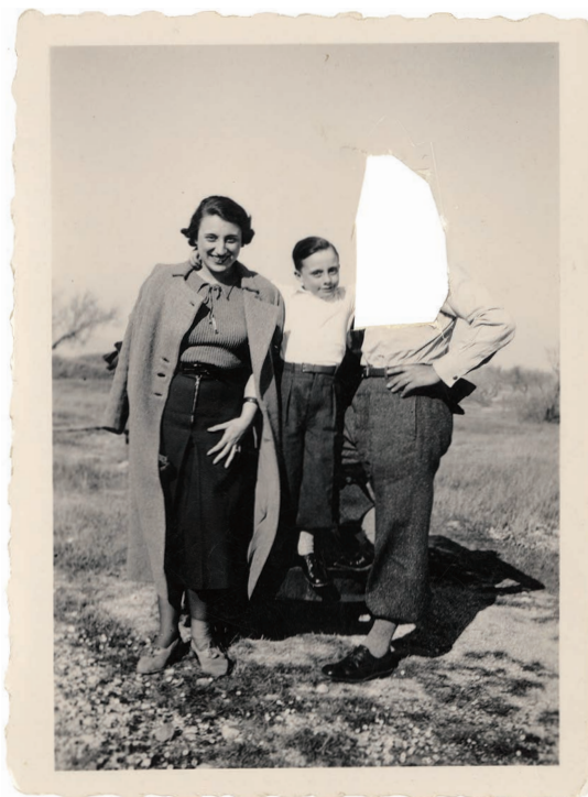
7 / Anonyme Family photographs 1930s Collection of the musée Nicéphore Niépce © musée Nicéphore Niépce